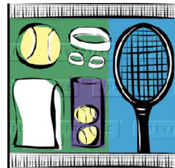
Sporting Equipment $50