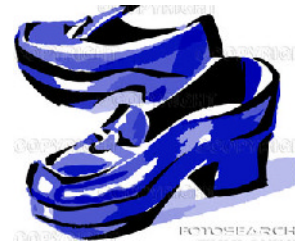
Shoes $20 each