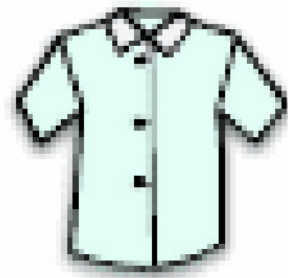
Clothing $15 per piece